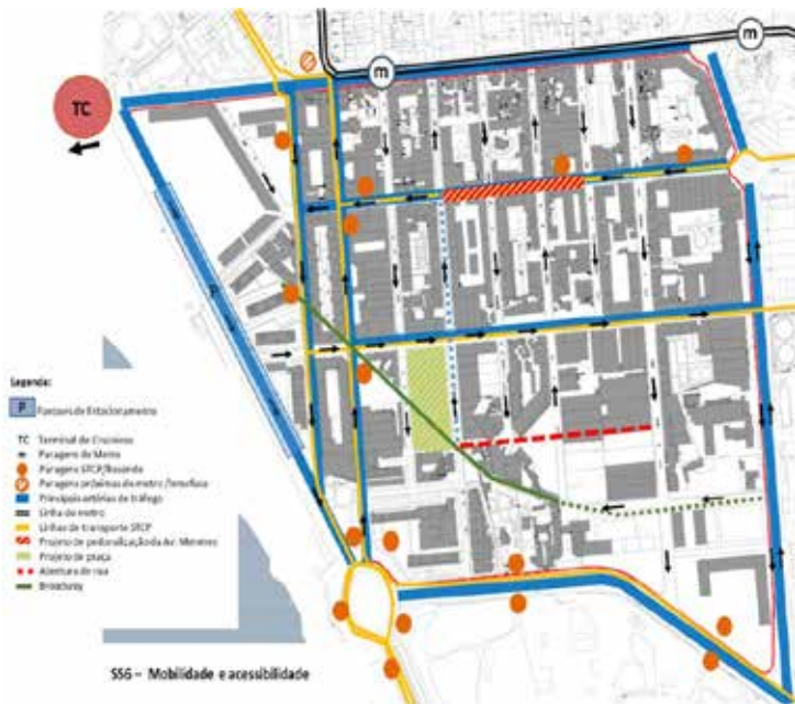
Mobility system proposal for South Matosinhos

The third, and last project to briefly highlight here is the Póvoa de Lanhoso's City Centre Urban Rehabilitation Strategic Programme, which was recently presented to the City Council. This Strategic Programme defines a local urban regeneration strategy, as well as a mid-term action plan. Also, it identifies the public and private initiatives that are needed to improve the quality and the attractiveness of the urban space in this area. The action plan also quantifies the financial resources needed and potential funding sources. After the approval, the Strategic Programme should be presented and discussed publicly.