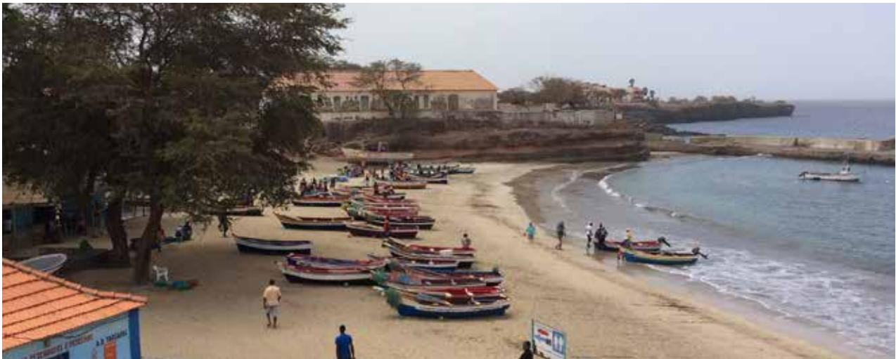
Fishing area in one of Cape Verde's islands

The study is based on a diagnosis, analysis of the institutional and legal framework, characterization of stakeholders in the tourism sector and the synthesis of the main opportunities, threats and main challenges of tourism development in Cape Verde, as well as its the potential impacts.