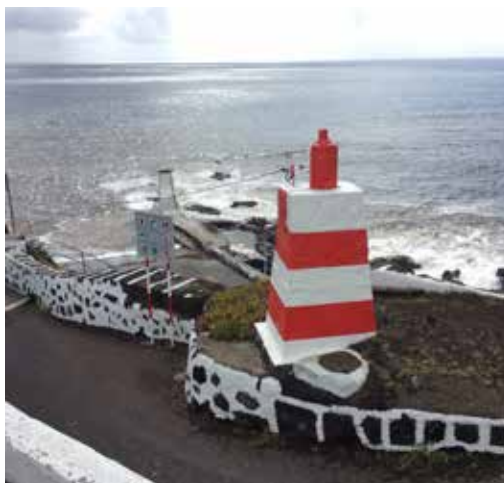
Terceira Island Landscape

There is an ongoing update to the Spatial Plan for Coastal Area of Terceira Island, in Azores, for which Quatenaire Portugal was responsible in 2005. The plan's modification, in which the company is collaborating with the Regional Directorate for the Environment, is due to the need for adaptation to current reality of the territory and to its social, economic and environmental features. The first steering committee meeting has occurred in October, launching the field work.