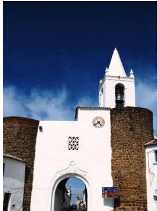
Redondo's Historic Centre

Following these objectives, Quatenaire Portugal , in partnership with Portalegre's Polytechnic Institute, carried out a work that included analysis of key documents and national and international statistics, as well as analysis of the Redondo's positioning in specialized websites. Also, our team promoted meetings with companies and other local and regional players, and conducted two surveys (one for local actors and the other to assess the tourist satisfaction). The Plan also includes several seminars to present and publicly discuss the objectives, methodology and preliminary and final results of the study. Until this moment, two meetings have already being held, on 29 May and on 23 October.