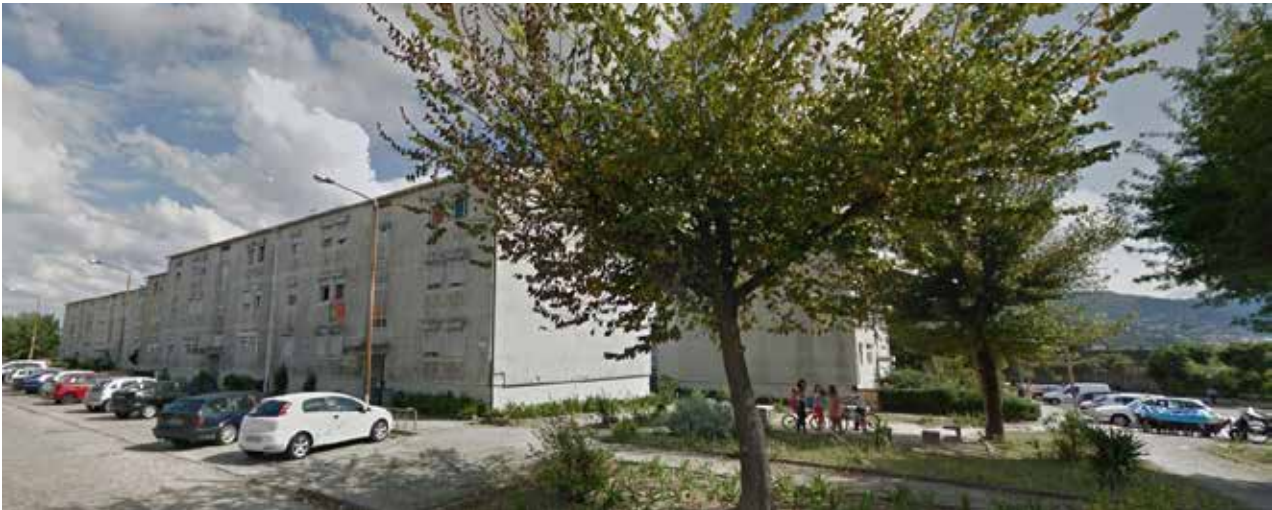
Ringe's Housing Complex

The ATIVA_MENTE project is an integrated project for active inclusion in Santo Tirso city, developed by the Municipality in partnership with the Ringe's Housing Complex Residents' Association, a municipal social neighborhood.