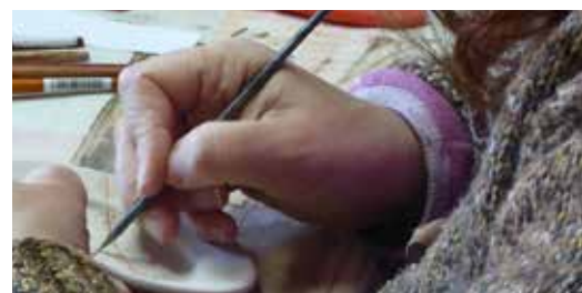
Alentejo traditional pottery

The project aimed to contribute to the dynamization of a more structured and updated regional tourism offer, in line with the main international trends.