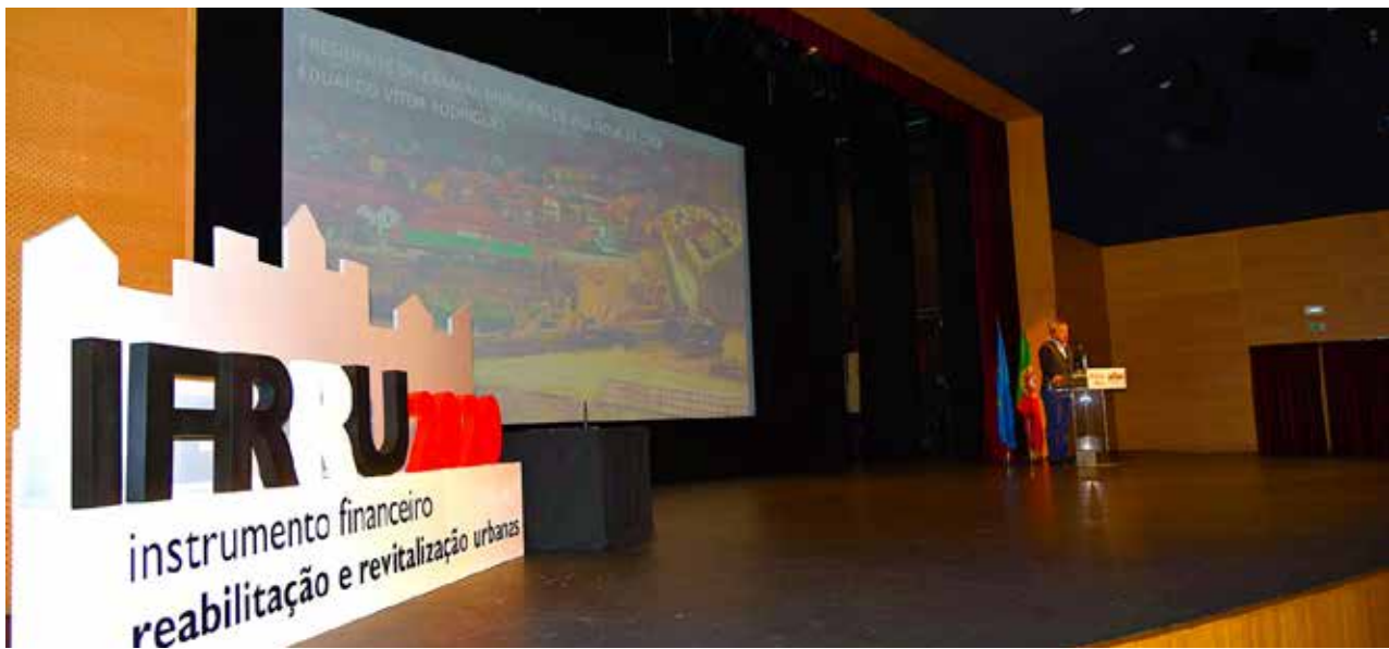
IFRRU 2020 annual event (6 November 2018)

Quatenaire Portugal has been following the implementation of the Financial Instrument for Urban Rehabilitation and Revitalization (IFRRU) 2020, a financing instrument created to increase urban renewal in Portuguese cities.