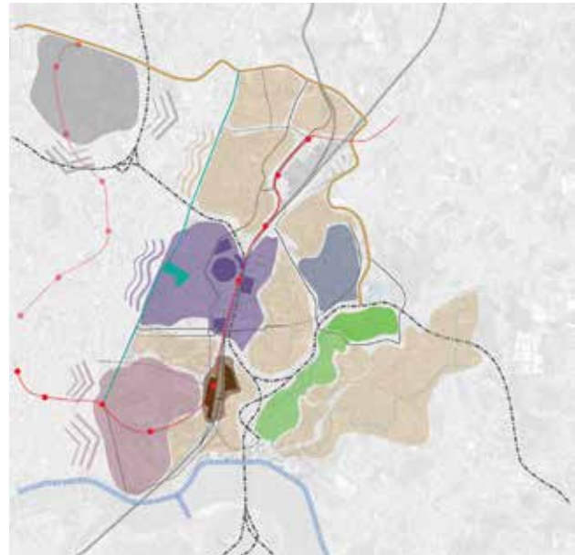
Site analysis scheme