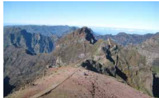
Madeira Island Landscape

This Programme will define a territorial based strategy for the region's development, integrating sectoral and national territorial policies as well as local strategies. It aims to become a reference board to other regional programmes and local masterplans.