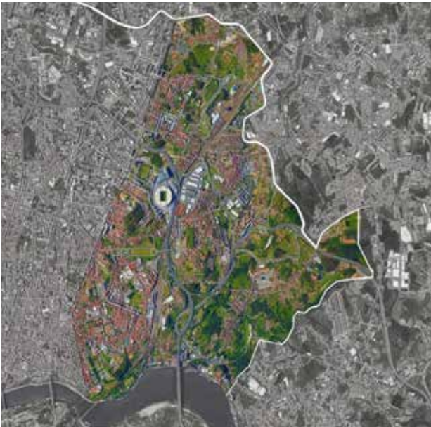
Masterplan intervention area