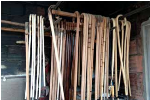
Walking sticks and umbrellas workshop at Gestaçô (Baião)

Invited by the Baião City Council, Quatenaire Portugal is developing an assessment of the potential for recognizing and valuing intangible cultural heritage manifestations in this municipality. These intangible manifestations are part of the social and cultural history of a given community and territory, due to the uniqueness of techniques and products, the exceptional quality of execution, and also by its symbolic value of cultural representation and its aesthetic quality that determines the demand for these productions.