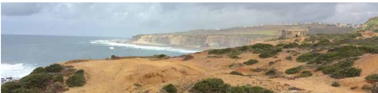
The site of the futuro Ecological Park

The project includes a small building aimed to support the activities of the park, as well as parking and access to emergency vehicles.