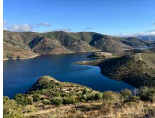
Baixo Sabor Dam Landscape

The programme aims to ensure the quality of water resources and to help manage the use of land and water surface in accordance with the reservoir's purpose.