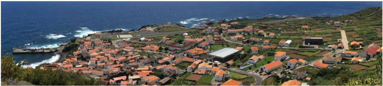
Panoramic view of the island of Corvo

Quaternaire Portugal will collaborate with the Municipality of Lourinhã in the evaluation of the public discussion process and the production of the final version of the Municipal Master Plan, which is expected to be approved by the Municipal Assembly by the end of this year. The Lourinhã's Municipal Master Plan is one of the first Municipal Master Plans to be reviewed in the light of the West and Tagus Valley Regional Plan and, simultaneously, in the light of the new Law for the Soil Policy, Spatial Planning and Urbanism.