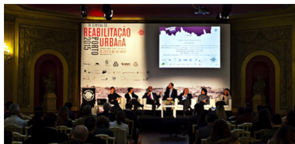
Debate "New horizons for Porto's urban regeneration", held on 30 October, at Ateneu Comercial do Porto.